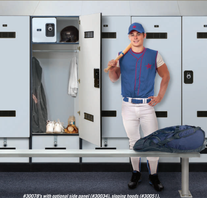
#30078's with optional side panel (#30034), sloping hoods (#30051), combination padlocks (#30020), custom engraved name/number plates (#30060) and aluminum bench (#77778) displayed

Note: It is recommended that all lockers be wall and/or floor anchored.