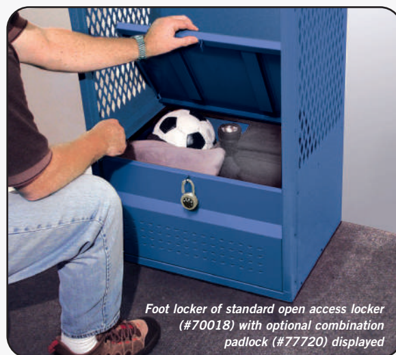
Foot locker of standard open access locker (#70018) with optional combination padlock (#77720) displayed

Note: Built-in locks are pre-installed on assembled lockers.